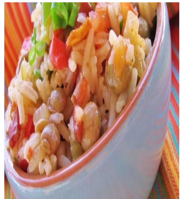
The Island: peas & rice